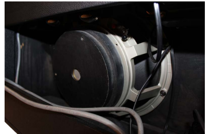
cabinet resonance frequency: 50 Hz