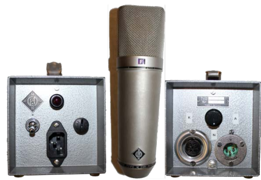
Neumann ™ U67 in the U269 version with remote-controlled directional characteristic