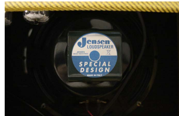
cabinet resonance frequency: 69 Hz