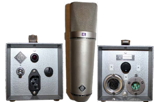
Neumann™ U67 in the U269 version with remote-controlled directional characteristic