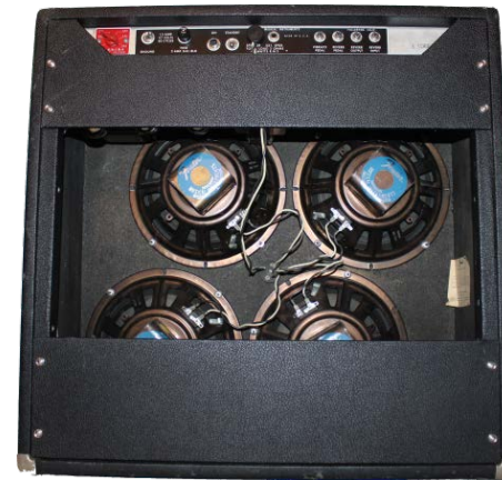
cabinet resonance frequency: 69 Hz