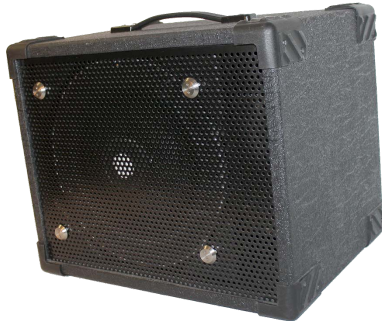
cabinet resonance frequency: 120 Hz